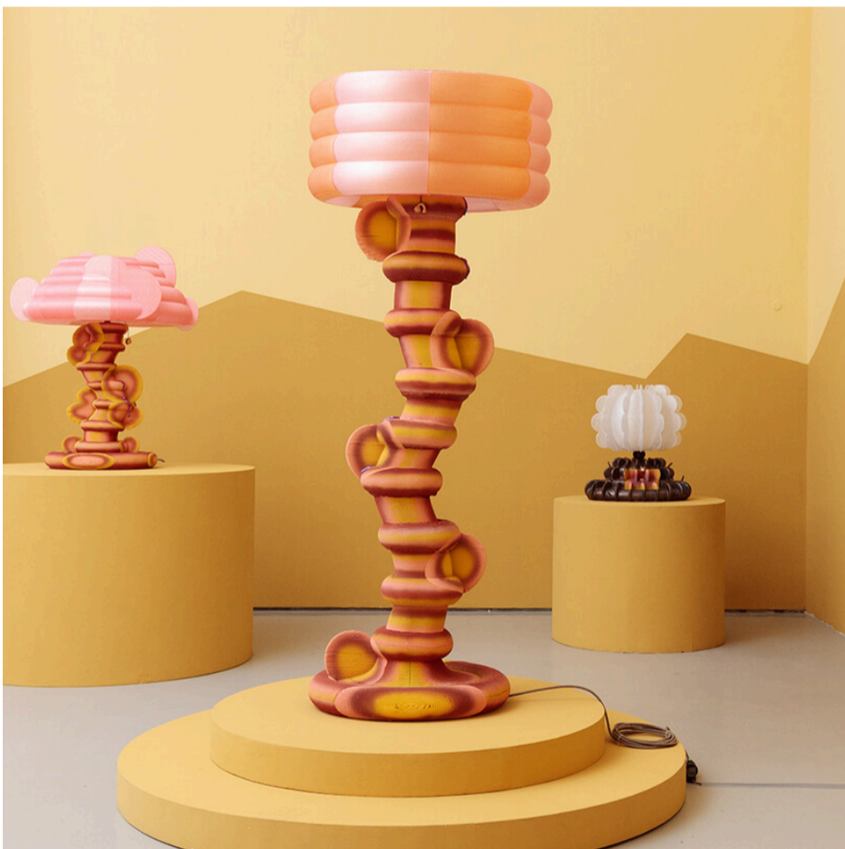
Power clash 25 Apr – 15 Aug 2025