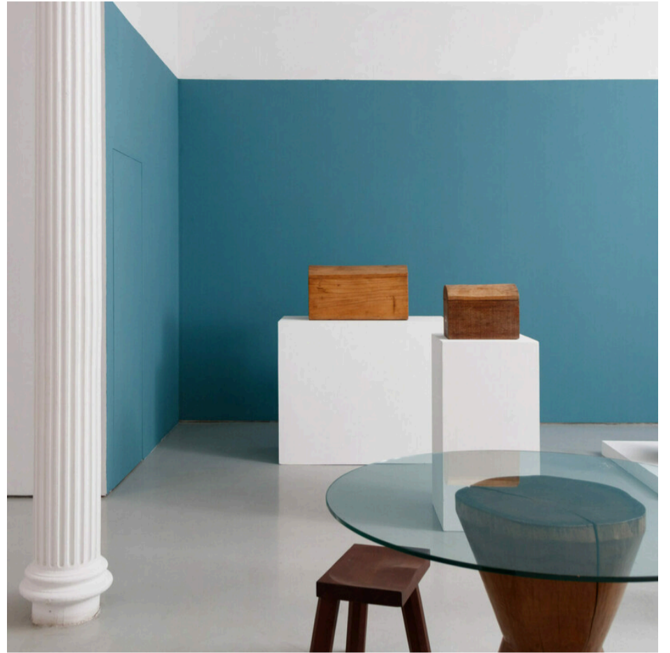
Brazil modern 25 Sep 2025 – 13 Feb 2026