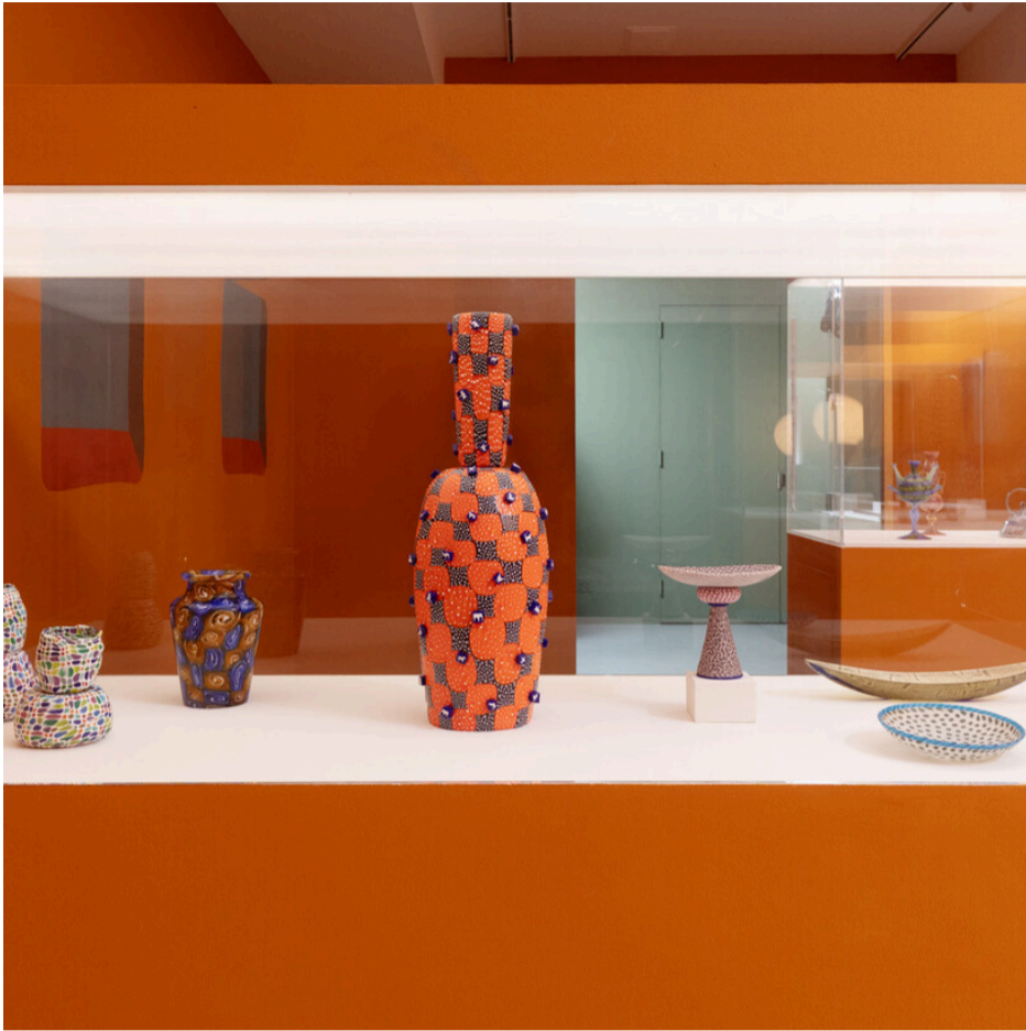
Murrine–Murano–Marquis 23 Feb – 27 Mar 2026