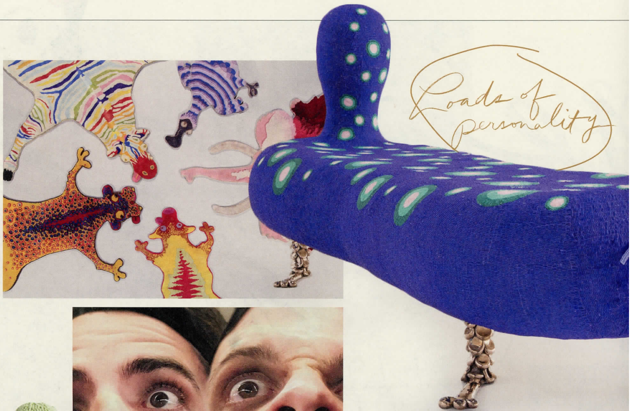
BASIC EXTINCT/ PLEASE DON'T WEAVE (2017) WOOL AND SILK