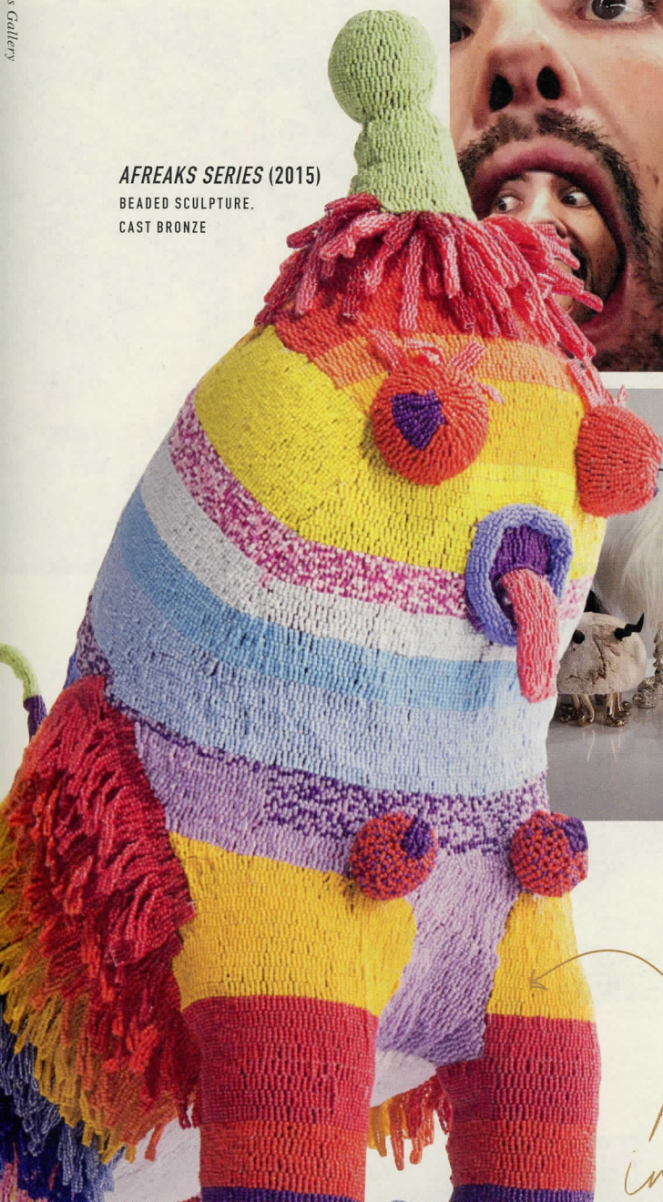
AFREAKS SERIES (2015) BEADED SCULPTURE, CAST BRONZE