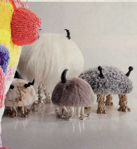
MINI BEASTS (2014) FUR, EBONY, CAST BRONZE, LEATHER