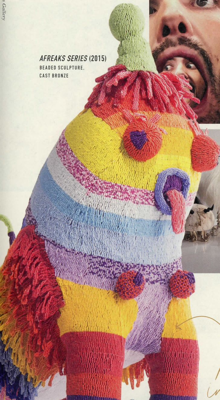
AFREAKS SERIES (2015) BEADED SCULPTURE, CAST BRONZE