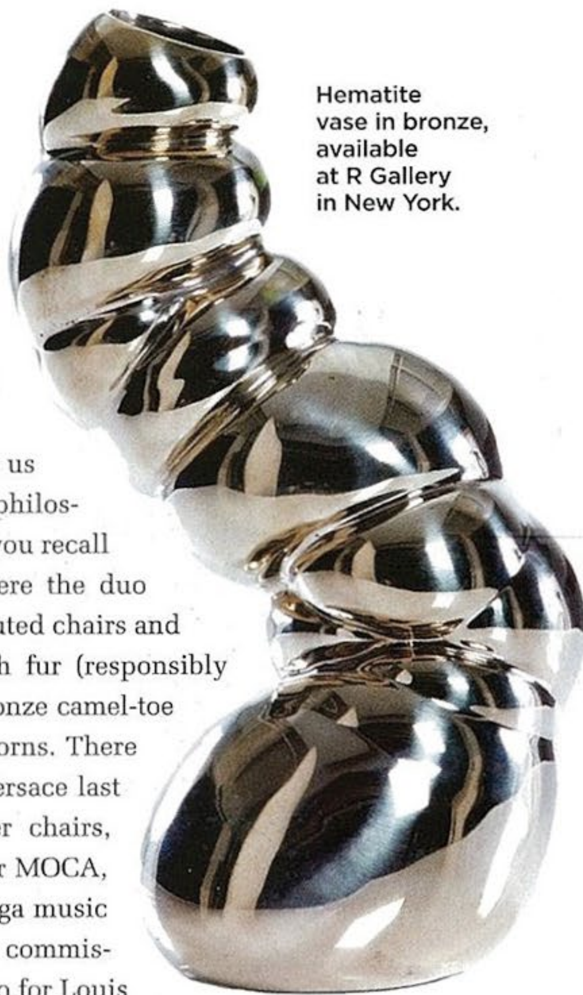
Hematite vase in bronze, available at R Gallery in New York.