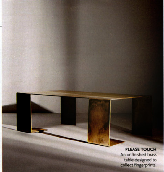
PLEASE TOUCH An unfinished brass table designed to collect fingerprints.